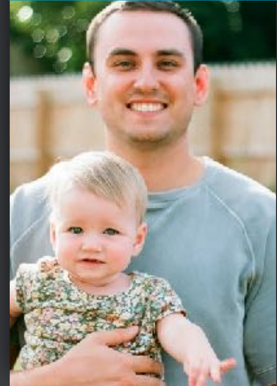
DIGITAL MINISTRY DIRECTOR