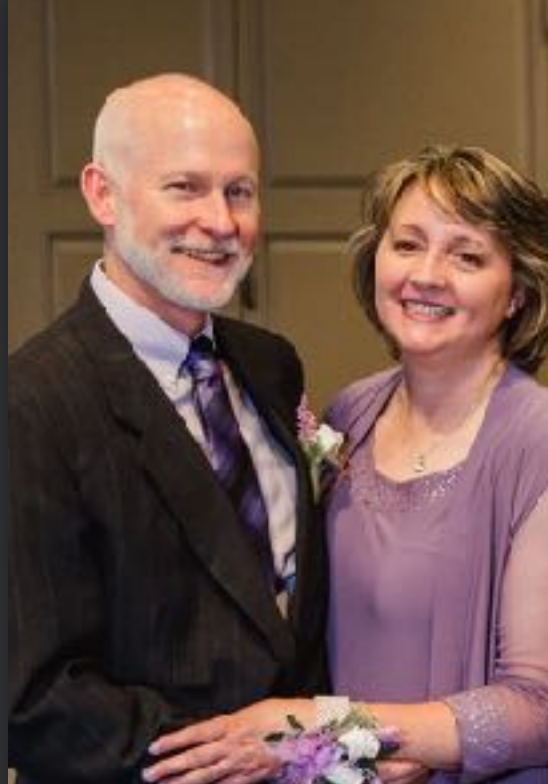
FIRST IMPRESSIONS DIRECTORS

THANK YOU TEAM MEMBERS TEAM LEADERS & TEAM DIRECTORS